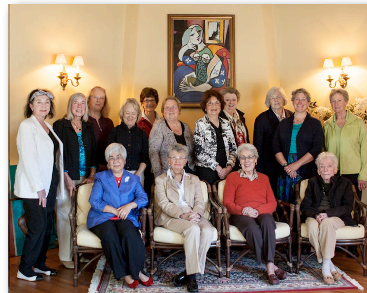
Garden Club Outgoing Board and Committee Chairs

The Garden Club ends its fiscal year 2012-2013 in the month of May with a new board elected. The new officers (see side panel) will be installed at the general meeting and Year-End celebration on May 31st.