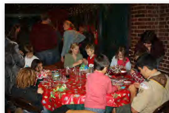
At the craft table