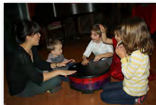
Making music together